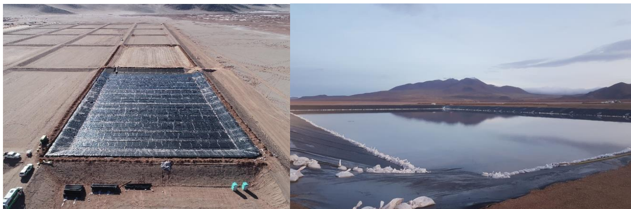
Figure 1: Lining and filling of demonstration ponds at Sal de Vida

Engineering studies related to logistics and energy studies progressed as planned throughout the quarter.